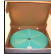
120' coil of ribbon