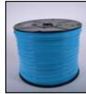
1000' spool of Sanipull ribbon