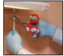
Bandage scissors make installation easy and are available to order