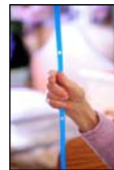
Ergonomic design is easy to see and grab

Consult the SanipullBulk Premium Price Matrix if you need additional clips, grab handles or bulk ribbon (3 length options: 1000' spools, 360' spools or 120' coils)