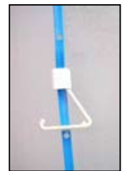
Optional grab handle can be positioned anywhere on the ribbon